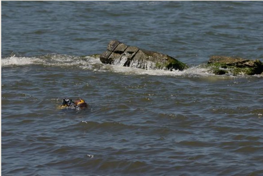
Rescue & Recovery Diving and Evidence / Lost Article Recovery