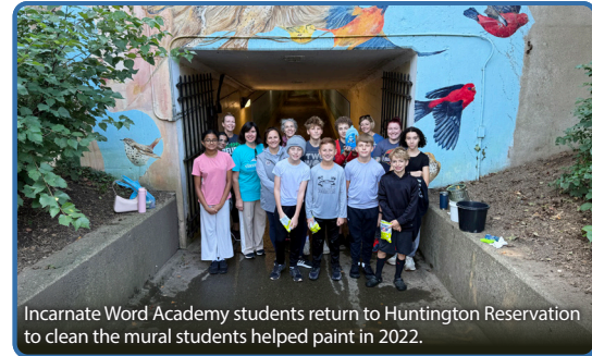
Incarnate Word Academy students return to Huntington Reservation to clean the mural students helped paint in 2022.