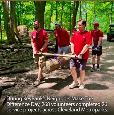
During KeyBank's Neighbors Make The Difference Day, 268 volunteers completed 26 service projects across Cleveland Metroparks.