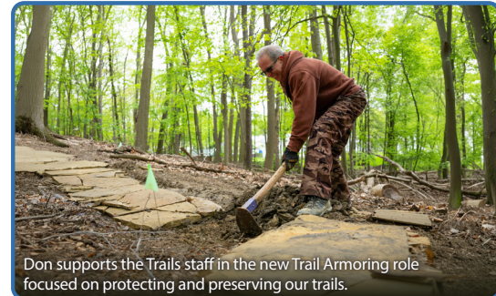
Don supports the Trails staff in the new Trail Armoring role focused on protecting and preserving our trails.