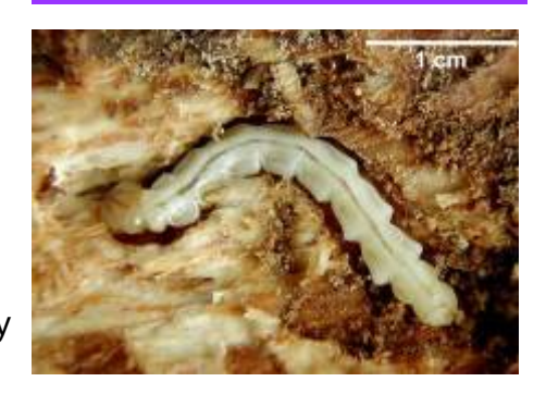
Eab laravae stage