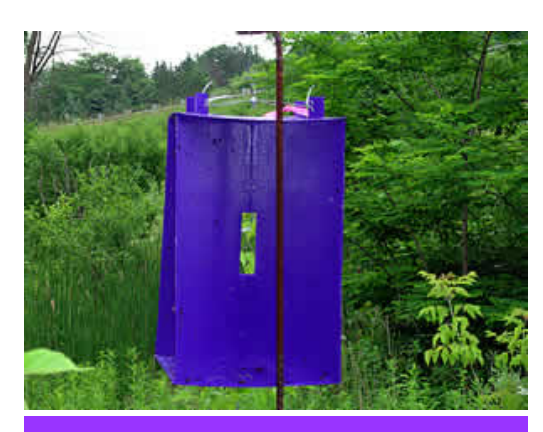
New EAB Detection Trap