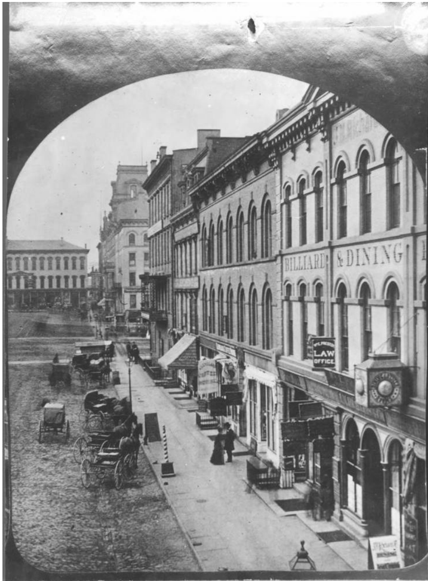
Left: Cleveland Public Square, 1870s