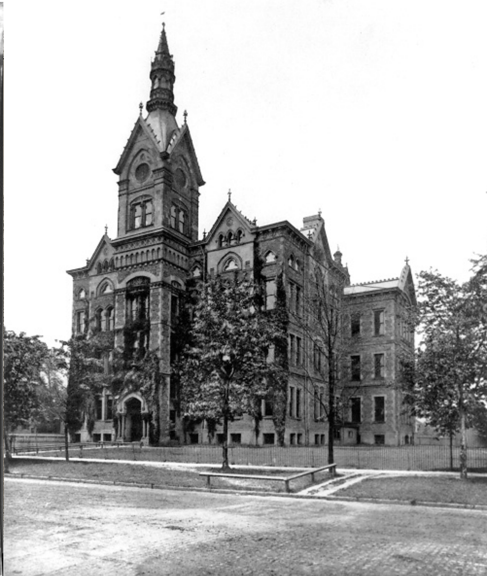
Right: Central High School, 1880s