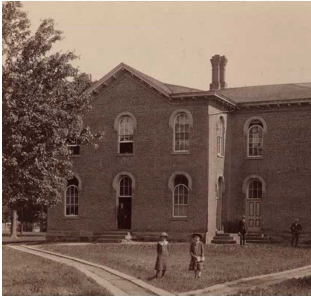
Society Hall, Oberlin College