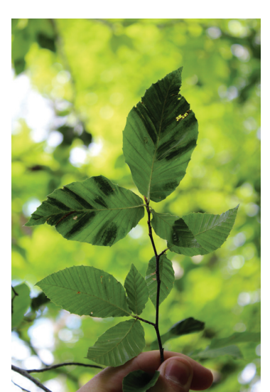
Figure 1.—Banding appearance associated with BLD.

BLD appears to be spreading, particularly from west to east based on the number of new county detections in recent years. Insect or avian vectors as well as human-mediated movement of the nematode are possible modes of its dispersal that are currently being studied. There is likely a delay between initial nematode infestation and BLD detection as L. crenatae has occasionally been confirmed in asymptomatic tissue at the molecular level.