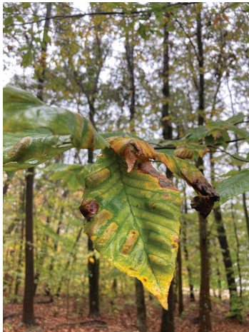
Figure 3.—Advanced symptoms of BLD with chlorotic striping.