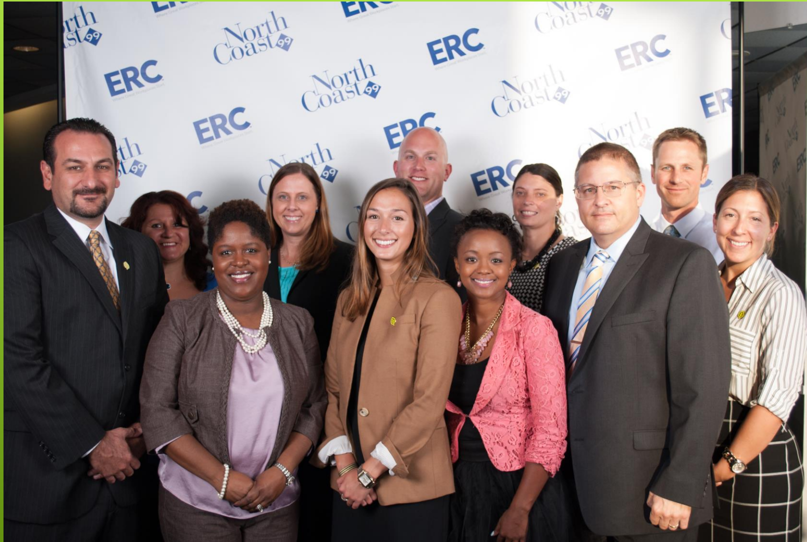
AWARDS DINNER AT LANDERHAVEN SEPTEMBER 24, 2015