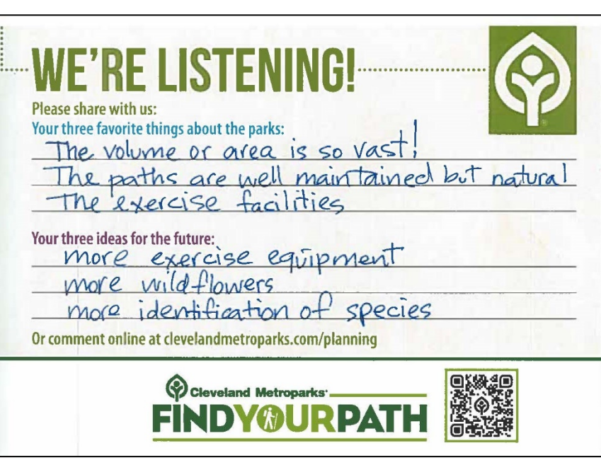
Sample comment card collected through engagement efforts

The map below shows the geographic distribution of these efforts. The east side lakefront saw the most events as feedback was being gathered both for the system plan and the Cleveland Harbor Eastern Embayment Resilience Study (CHEERS), a partnership effort with the City of Cleveland, Port of Cleveland, Ohio Department of Natural Resources, Ohio Department of Transportation, and Black Environmental Leaders to develop new parkland in the Lakefront Reservation north of E. 55<sup>th</sup> Marina and E. 72<sup>nd</sup>/North Gordon Park by beneficially reusing dredge material from the Cuyahoga River.