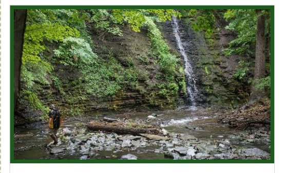
MINERALS AND ROCKS

Minerals and rocks are important in our daily lives.