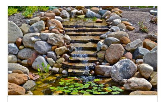
STORMWATER AND SUSTAINABLE DEVELOPMENT

Minerals and rocks are important in our daily lives.