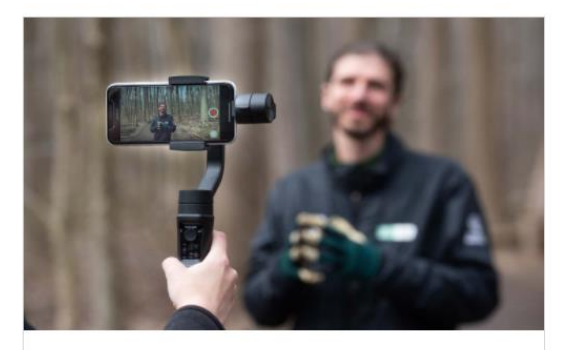
VIRTUAL LEARNING Welcome to Cleveland Metroparks Virtual Learning!

Cleveland Metroparks offers diverse, hands-on education opportunities for all!