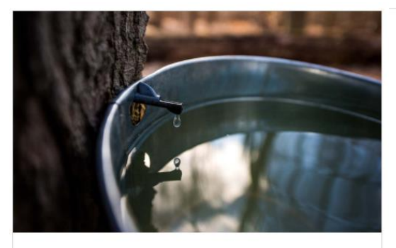
MAPLE SUGARING 101

Explore the natural history of many familiar and unfamiliar species of Cleveland Metroparks.