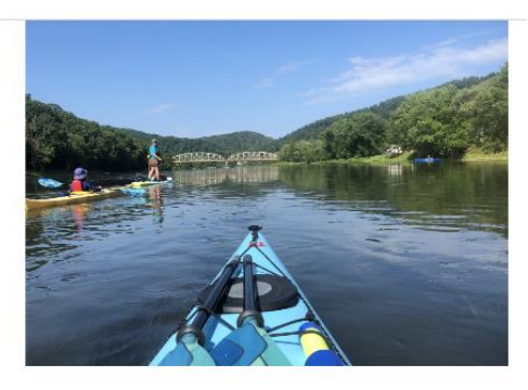
SKILLS AND THRILLS - PADDLING THE ALLEGHENY RIVER & LAKE ERIE WATER TRAIL

Watch a virtual program revealing the process of transforming tree sap into tasty syrup.