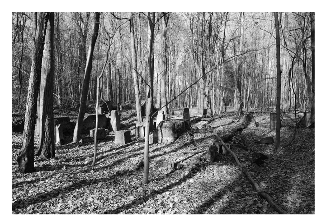
Stone Quarry building ruins, Bradley Woods Reservation

Most of the historical buildings owned or managed by Cleveland Metroparks are park-related, such as picnic shelters. Several of these shelters are excellent examples of the work of CCC and WPA crews in the Park District during the Great Depression. Indeed, two CCC camps were located in the Park District, one at Euclid Creek and the other at Brecksville. Crews from these camps would range throughout the parks, building shelters, nature centers, roads, bridges, and retaining walls. These CCC and WPA features of the Park District helped to create a distinctive character common to the original nine reservations, known as the "Legacy Parks": Bedford, Brecksville, Big Creek, Euclid Creek, Rocky River (including part of modern-day Mill Stream Run), Hinckley, Huntington, North Chagrin, and South Chagrin.