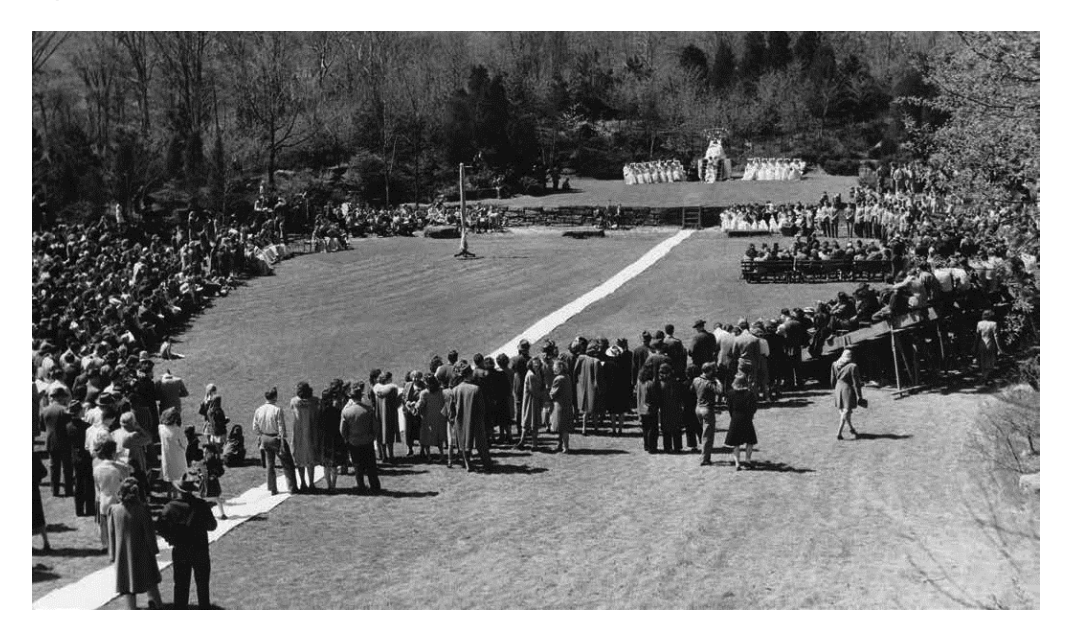
May Day at Music Mound, 1944 (Cleveland Metroparks)

This document is a reference and guidance for park staff going forward into the second century of existence for Cleveland Metroparks. The Plan is meant to serve as both a reference document and as planning guidance, and includes a brief history of Cleveland Metroparks, an explanation of the categorization system used to inventory and classify historical and cultural resources in the park system, individual reservation overviews with historical discussions and summaries of historic resource inventories, and guidance on plan implementation.