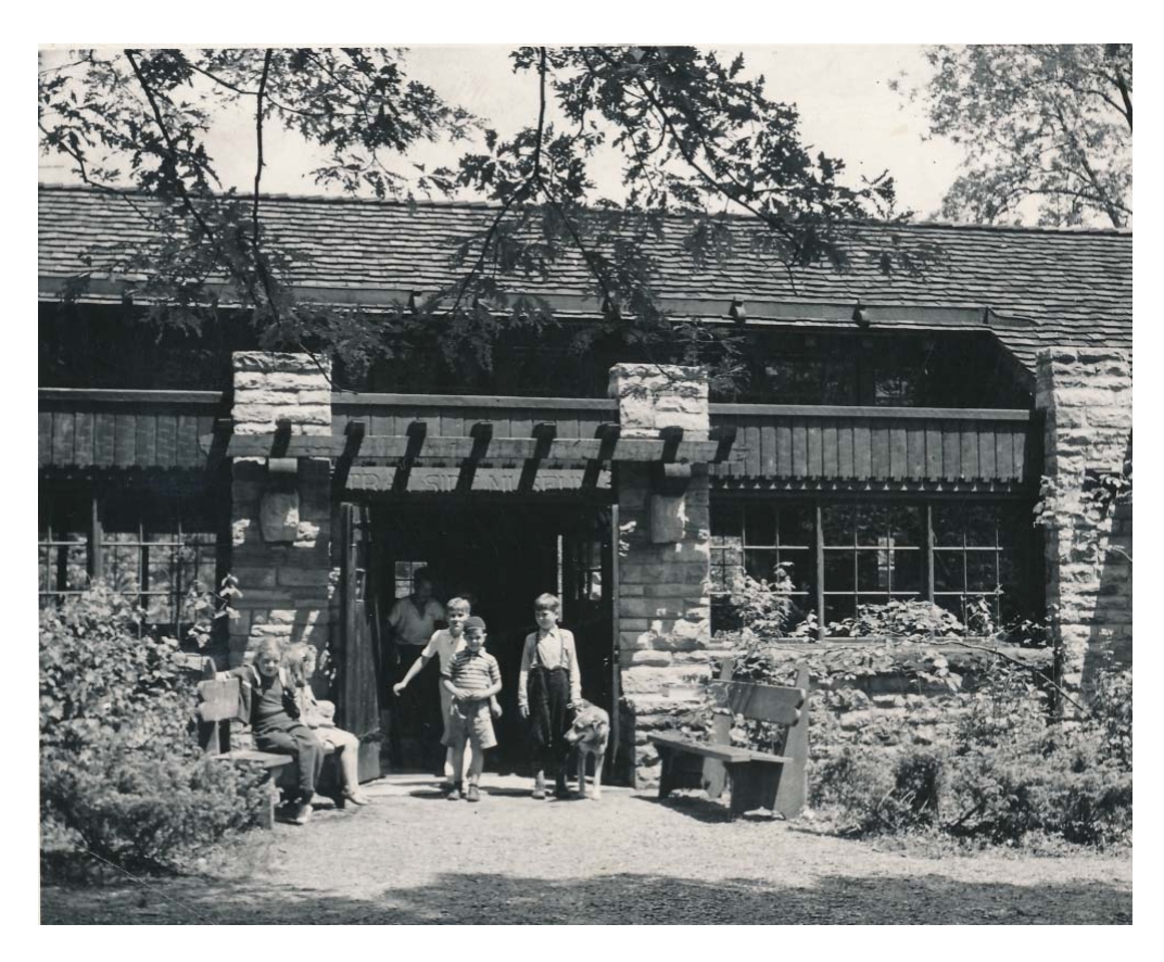
Brecksville Reservation Trailside Museum (now Brecksville Nature Center), 1940s (Cleveland Metroparks)

Historical structures include such things as bridges and stone walls, and are especially common at reservations where there was WPA/CCC activity. Most, if not all, the stonework structures in the Park District were built with labor supplied by crews working under the CCC, WPA, or other federal relief programs during the Great Depression, including structures found at reservations that were former city parks, like Garfield Park and Edgewater Park. The CCC and WPA crews worked under the direct management of the Park District. Landscape features, cultural landscapes, and objects are all relatively uncommon resources in the Park District, and include natural features, golf courses, historic districts, and memorials.