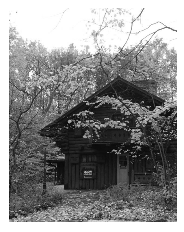
High Priority Resource Example: Look About Lodge, South Chagrin Reservation (Cleveland Metroparks)

The plan preparers classified most of the inventoried resources as Medium and Low Priority resources. The preparers largely reserved High Priority designation for resources considered to be key features of reservations, such as particularly fine examples of WPA-constructed buildings and structures, resources listed in the National Register of Historic Places, and resources that represent important people or events related to the Metroparks (such as the Harriet Keeler Memorial). In general, cultural and historical resources are currently well-managed within the park system. The plan preparers found few areas where improvement could be identified and no practices appeared to be of pressing need of adjustment in terms of impacting cultural resources. Perhaps the most important thing that park managers can do is to continue to raise awareness of the importance of the stewardship of historical and cultural resources among both park staff and park visitors.