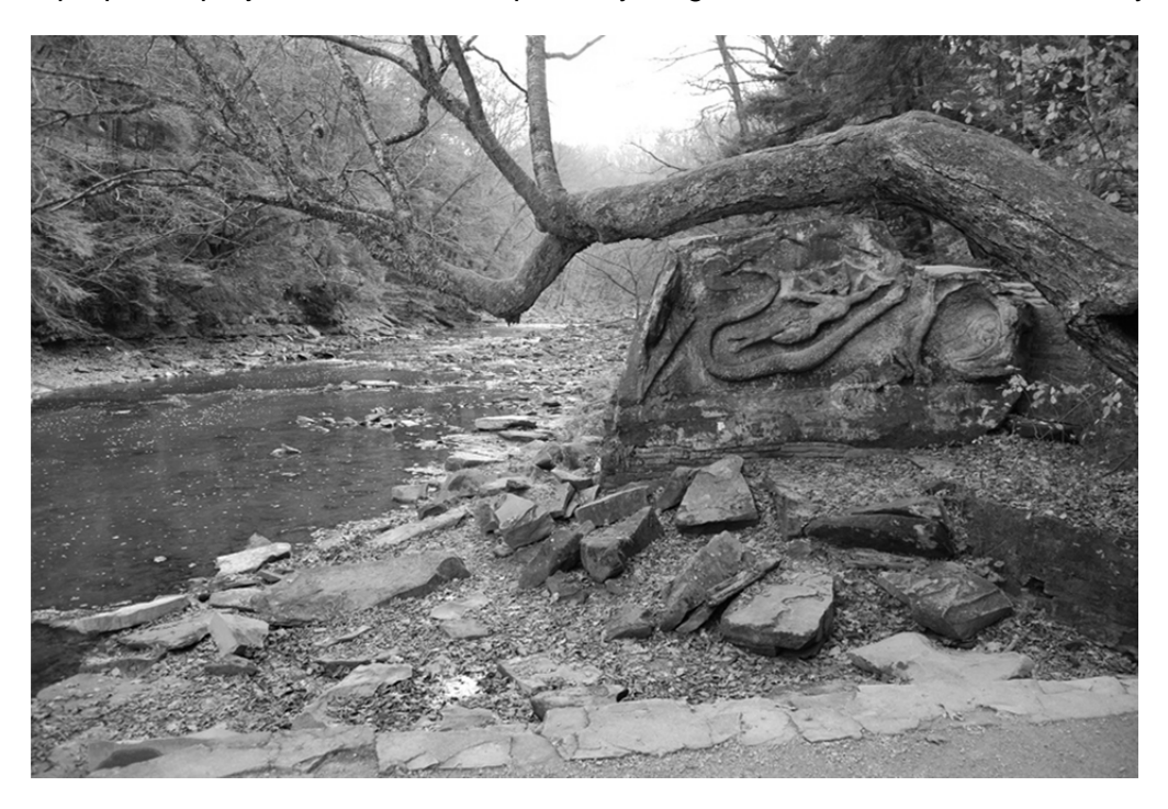
Chagrin State Scenic River and Henry Church Rock, South Chagrin Reservation

Appendices to the Plan include detailed maps and inventory tables for each reservation, a glossary of terms, a prehistoric cultural context for northeastern Ohio, a list of known Cleveland Metroparks affiliates relevant to historical and cultural resources management, an overview of relevant cultural resources laws and guidelines, and a list of references cited in the document. In addition to the Plan, Lawhon & Associates created and submitted a cultural resources Geographic Information Systems (GIS) geodatabase as part of this project. The geodatabase contains the locations of every resource inventoried in the plan, and also contains all the information presented in the resource inventory tables in the appendices. The geodatabase is intended to be integrated into the existing Cleveland Metroparks GIS and used in planning future park improvements. For example, Park GIS staff can quickly search the geodatabase to find out if a proposed project location will impact anything listed in the resource inventory.