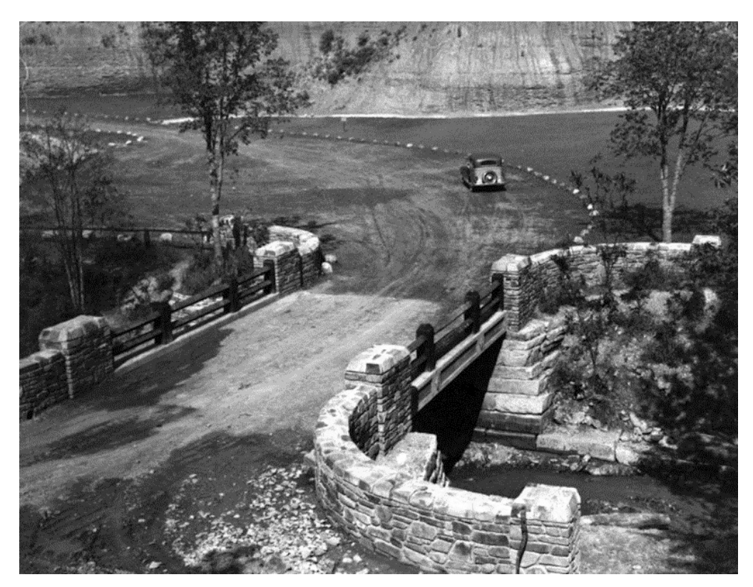
Quarry Picnic Area Bridge built by CCC, Euclid Creek Reservation 1935

parks, in reality know resources occur at about the same frequency, no matter the size of the park. Rocky River, with 2,572 acres and 46 resources, has the same frequency of occurrence as Washington Reservation, with 278 acres and one resource: about 0.02 resources per acre of park property.